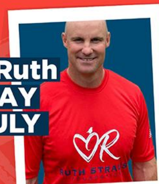
Sir Andrew Strauss